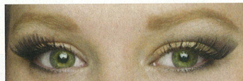
Wide-eyed beauty from the Nova Lash eyelash extension system.

Red carpet beauties are among the devotees of eyelash extensions, but salons around the country are offering this service to a growing clientele of regular folks with short or thin natural lashes. The service is lucrative at several hundred dollars for an application and upwards of $50-$100 for maintenance.