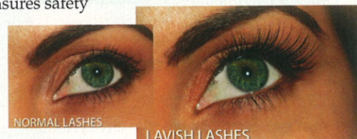
Natural lashes get a boost from Lavish Lashes extensions.

LAVISH LASHES professional eyelash extensions are water resistant and come in various lengths and colors. Tim Dana, president of the company, stresses Lavish Lashes' strict training standards—all professionals experience extensive training with a Lavish Lashes expert before performing actual salon applications.